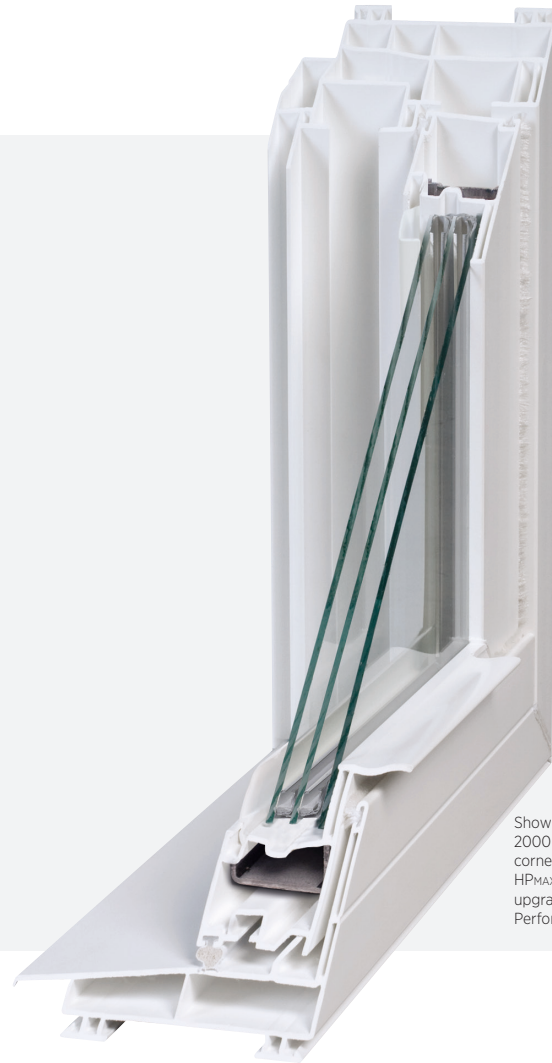
Shown in Contractor 2000 Series Double Hung corner cut featuring HP MAX glass package upgrade with High DP Performance option