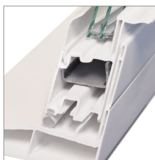
High DP Performance option features reinforced rails and stiles

Images show metal reinforcement in a double hung configuration. Also available for a sliding window.